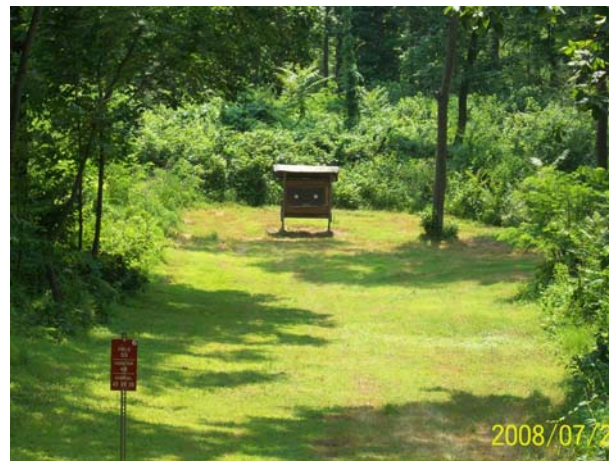
Wide shooting lanes and an example of the target sign and target butt.

The Mechanicsburg Archers will also be holding a Penn-Dutch League shoot June 20 & 21, 2009. This shoot is 14 Field & 14 Hunter Targets both days. This is a casual registration shoot from 7:00 A.M. to 11:00 A.M. both days.