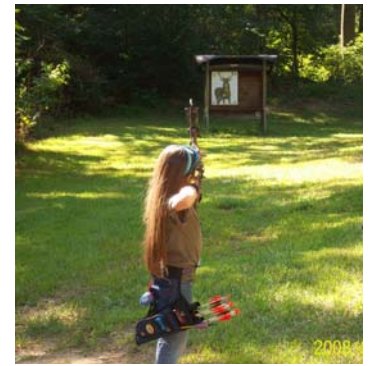
Youth at PSAA Animal Shoot. Target butts made of Celotex.

Our permanent courses have target butts made out of Celotex. Sometimes, depending on the type of arrows shot, this Celotex can leave a small residue on the shaft. Using an arrow lubricant to help prevent sticking and sometime even a steel pot scrubber to remove the residue can be beneficial.