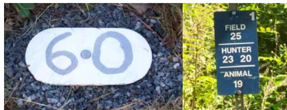
Examples of yardage markers in the ground and target number signs with yardages. Each course has its own color.