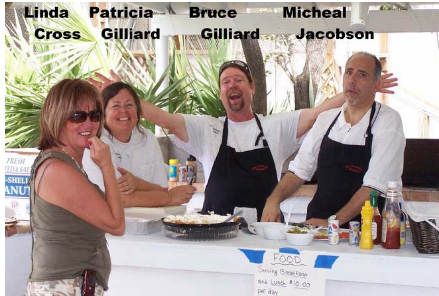
Cooking Staff – Fort Lauderdale