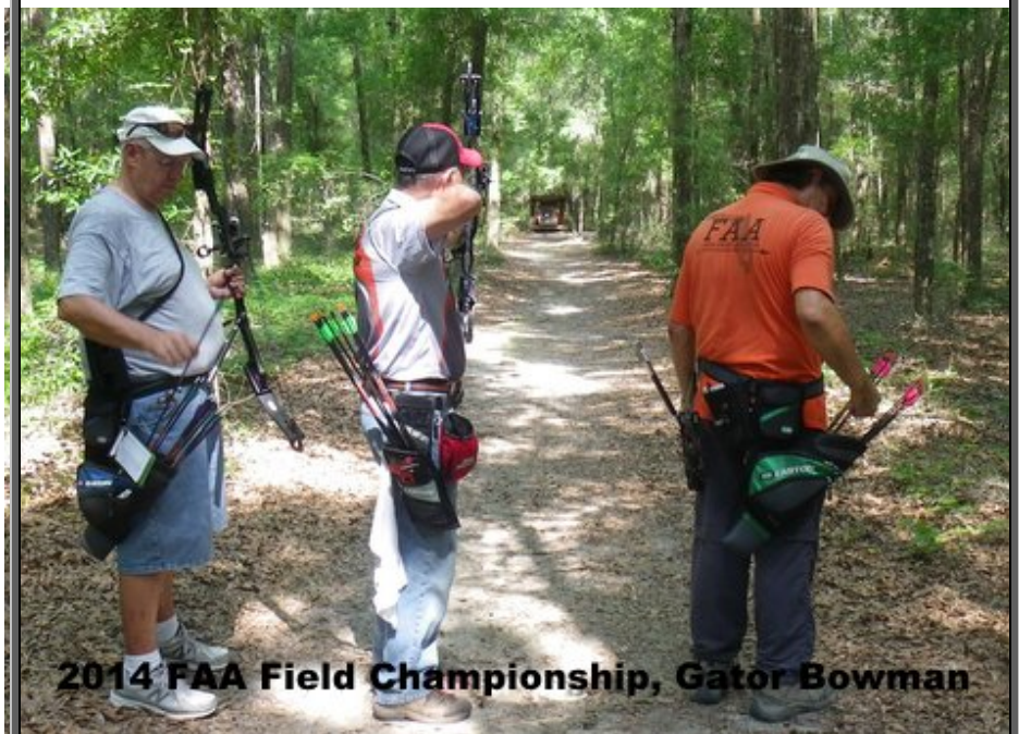
2014 FAA Field Championship, Gator Bowman

23 Nov Melbourne Brevard Archers Field Rd 23 Nov Ft Lauderdale 25 Animal 3-D, No Compounds 6 Dec Ft Myers Lee Co Archers Florida Sr Games 7 Dec Ft Lauderdale Club Shoot – NAFAC warm up 12-14 Dec Homestead Everglades Archers NAFAC 14 Dec The Villages The Villages 900 Rd 14 Dec Melbourne Brevard Archers 3D 21 Dec Dunnellon Citrus Archers Intl Rd 25 Dec Christmas