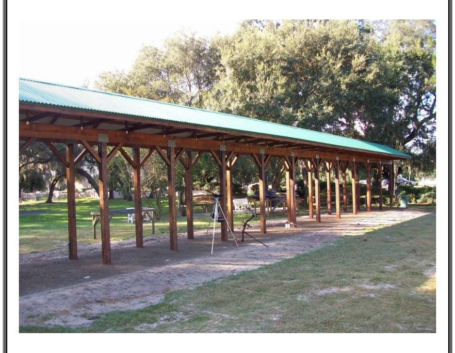
The Villages "NEW' shade cover

The range is now open. We have 17 targets for our tournaments. The surface is a combination of ground up rubber tires and other compounds to bind the material together. Its a comfortable surface to stand on and water will drain through the material. There is ample room behind the shade cover for chairs for the archers and guests to observe the shoot.