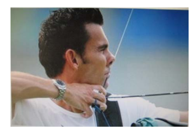
USA Olympic Archer - Vic Wunderle

PRSRT STD US POSTAGE PAID FT. MYERS, FL PERMIT NO. 442