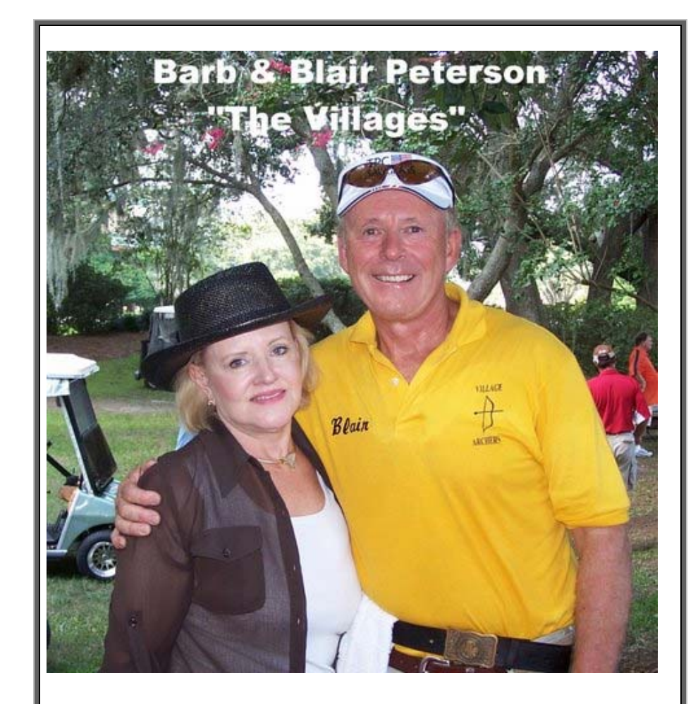
The Villages' Club President and Spouse