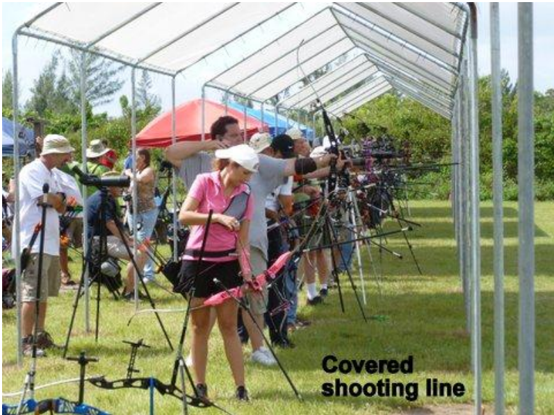
Gold Coast Archers, Del Ray Park