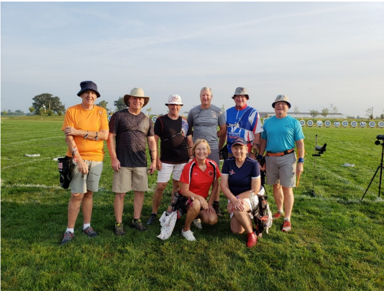
Florida Masters at the 2018 National Target.