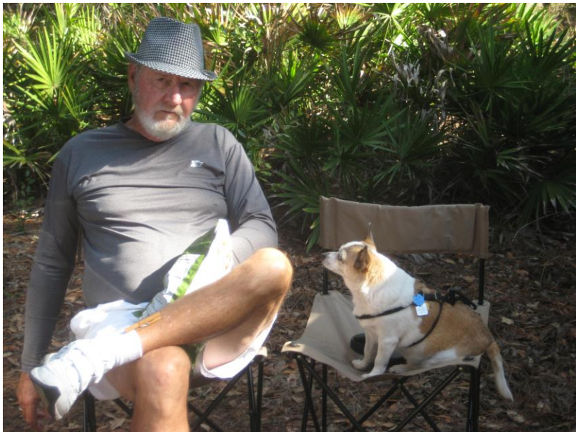
Break time Senior Games – Ft. Meade, FL