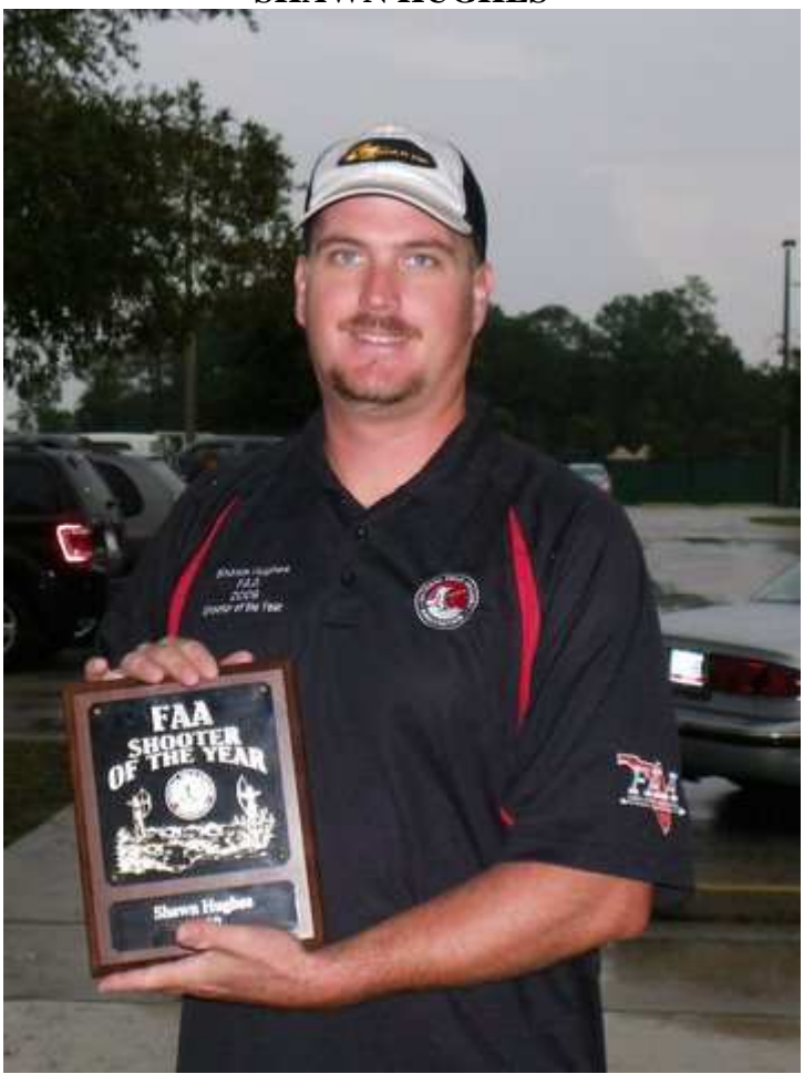
2009 MALE SHOOTER OF THE YEAR