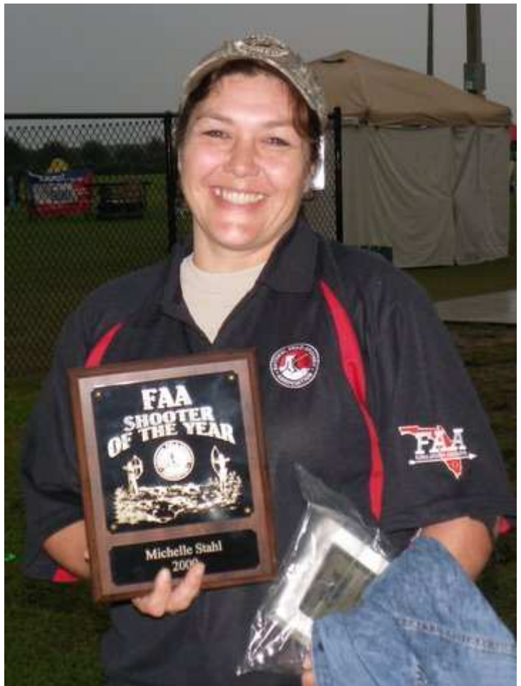
2009 FEMALE SHOOTER OF THE YEAR