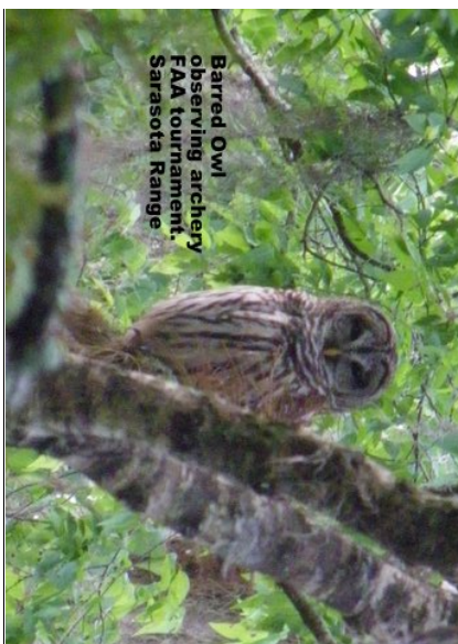
Barred Owl observing archery FAA tournament. Sarasota Range.