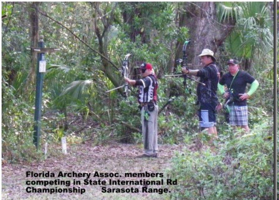
Florida Archery Assoc. members competing in State International Rd Championship Sarasota Range.

MISCELLANEOUS INFORMATION: Ranges are handicap accessible. NFAA membership required. Money and trophy class will be per NFAA by-laws. Pre-registration “no-shows” will receive refund less $2 processing fee.