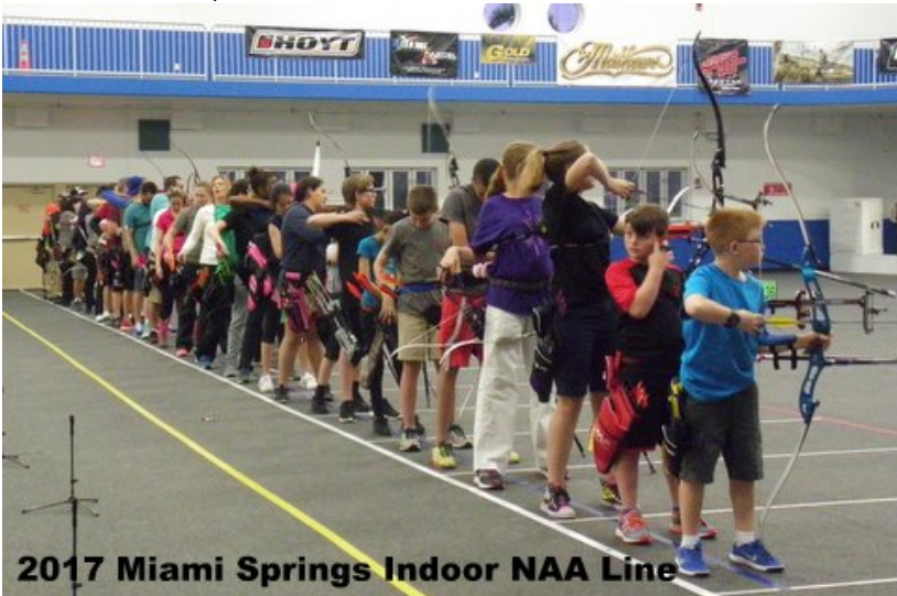
2017 Miami Springs Indoor NAA Line